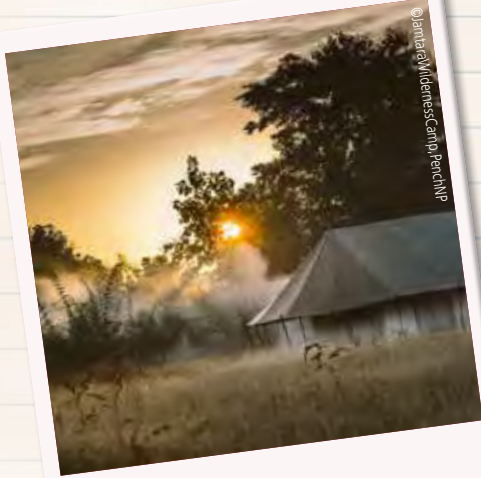
Rise and shine