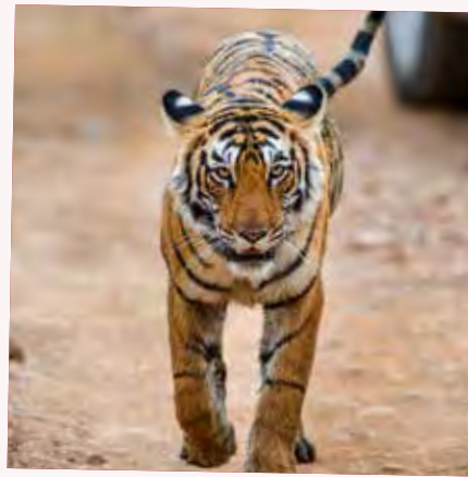
It's the real Shere Khan!

belongs to the property and has been adapted for more comfort. They seat fewer passengers and all will be fellow guests from your lodge.