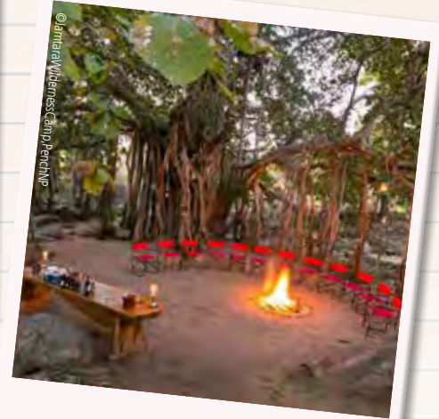
Perfect sundowner spot

Mid-afternoon, as the temperature starts to cool and predators awake from their afternoon slumbers, you'll set off on an afternoon game drive (except on Wednesdays in the Central India reserves). Whilst nothing compares